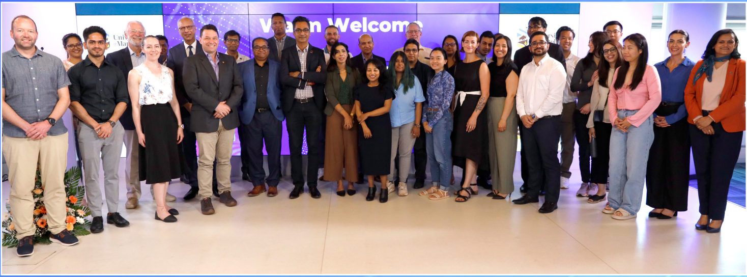
Group photo with the delegation from the University of Manitoba and higher management of MT